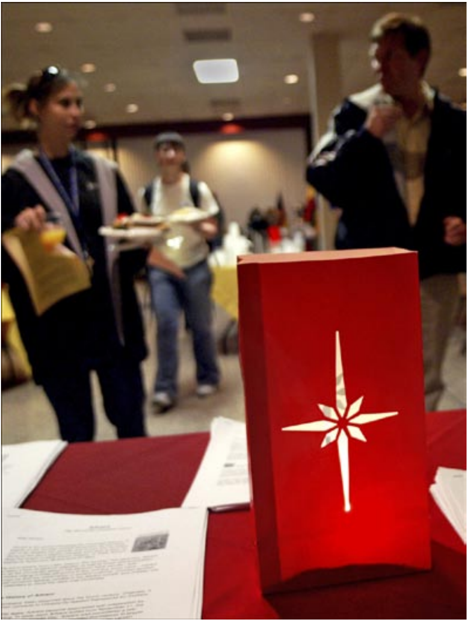
ECU’s annual holiday celebration of Worldfest Dec. 2 commemorated festivals such as Kwanzaa, Channukah, and Diwali.