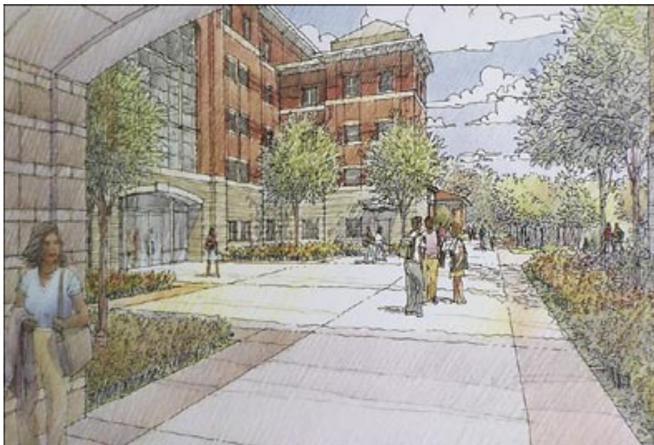
While construction has just begun on the College Hill residence hall, an artist's rendering provides a look at how the completed building will appear. The new residence hall, part of an expansion of on-campus student housing, is scheduled for completion in time for the fall 2006 semester.