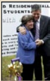
Ground Breaking On New Residence Hall, p. 5