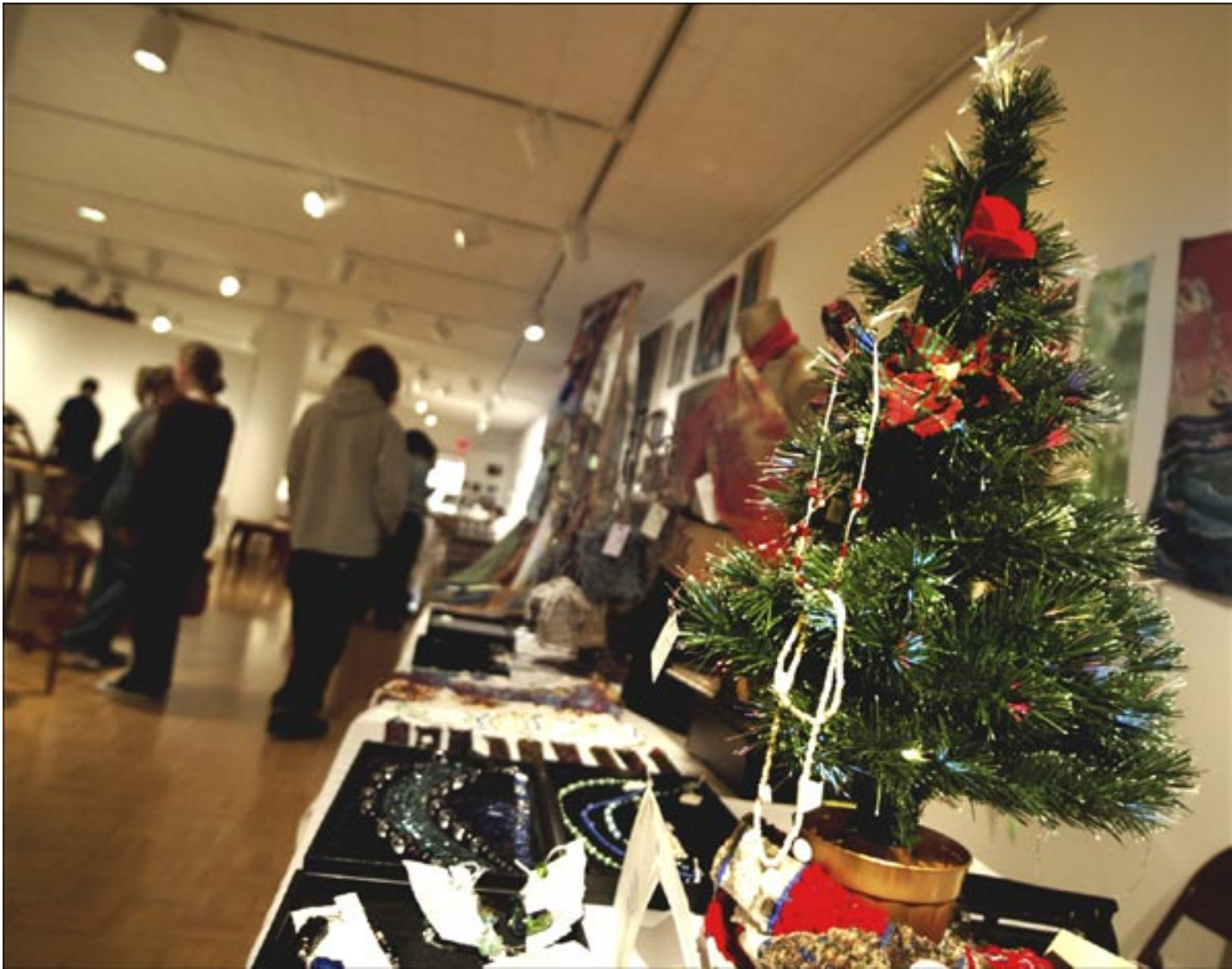
The much-anticipated annual holiday exhibition and sale, held by East Carolina University’s School of Art and Design, was held in Gray Gallery Dec. 2 through Dec. 4. Visitors to the event searched for the perfect gift among displays